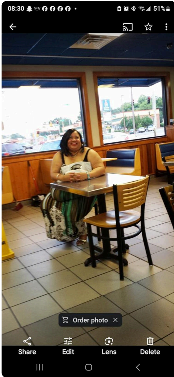
CLASS MEETING 2013