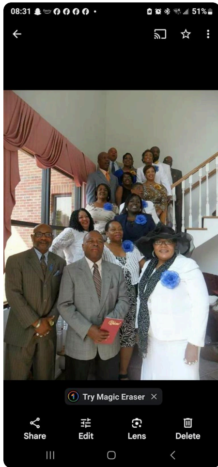
RHS CO 1973 CHURCH SERVICE