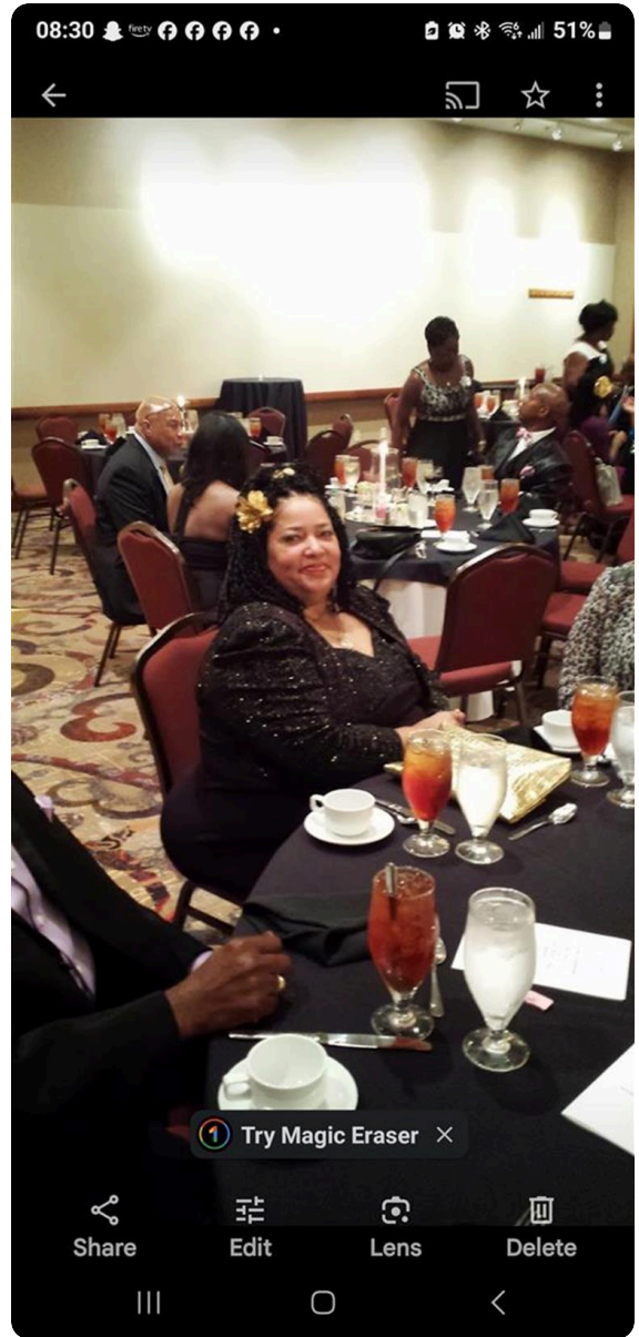
CLASS OF 1973 2013 REUNION DINNER